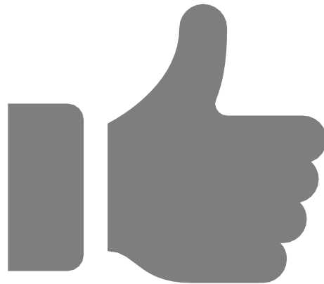
Appointed for task