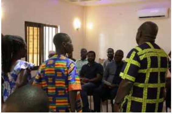
Figure 5: Consultation process with the local community to discuss project design and implementation strategies.