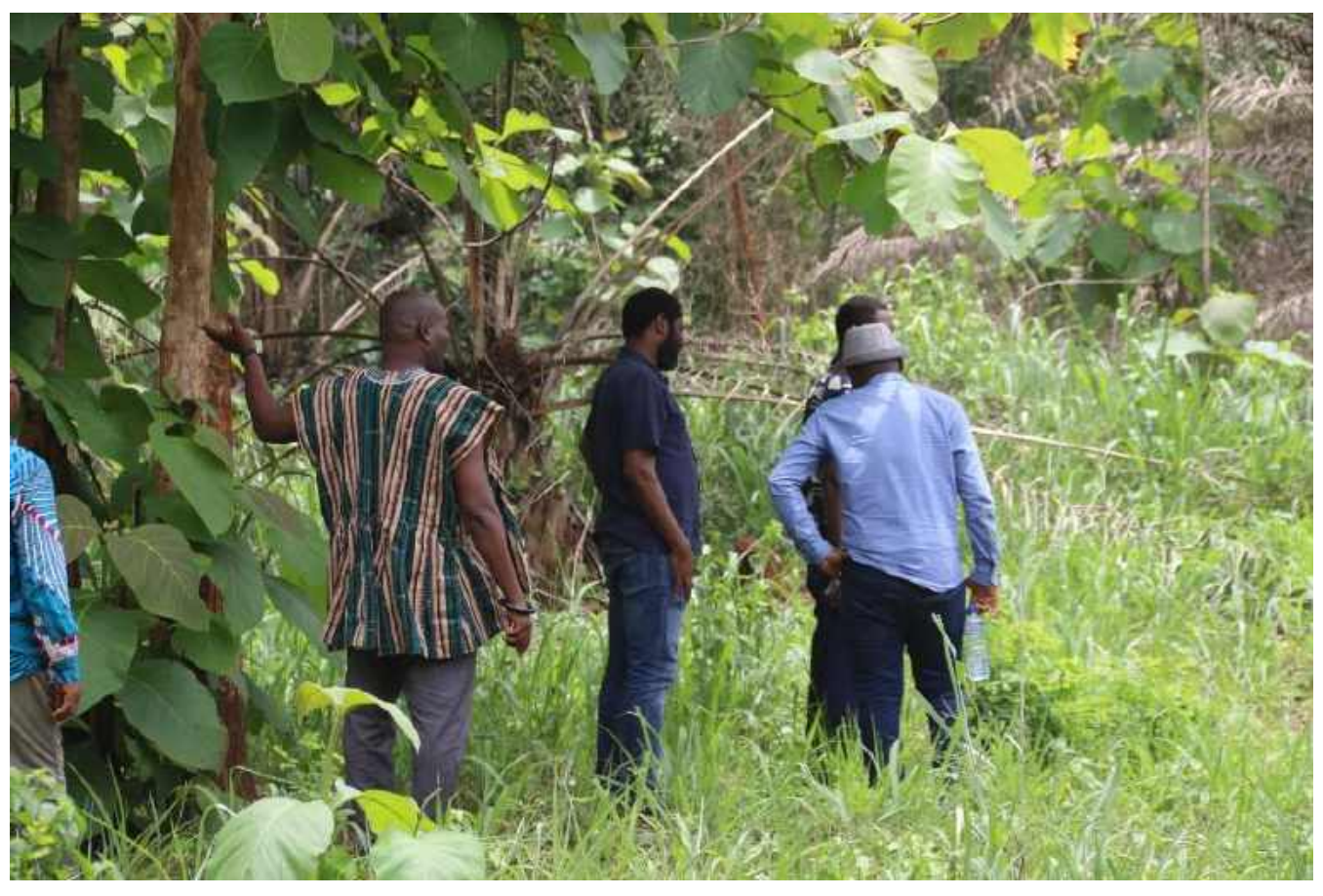
Figure 3: Field visit to understand the agro-ecological environment of the site for the project, to inform the agricultural activities to be implemented.