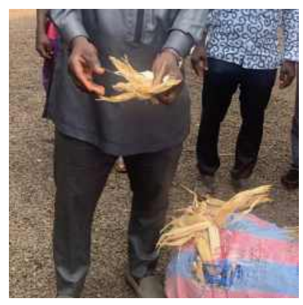
Figure 1: Field visit to the location of the first ECOVERSE village to understand the natural environment and adaptation needs in the location.

In the right-hand picture, a farmer's harvest from the previous season is affected in terms of quantity and quality due to excessive rainfall and the abrupt interruption of the rainy season.