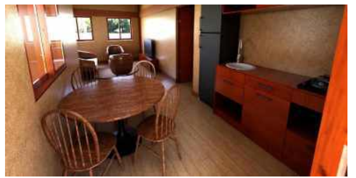
Figure 1: Visualization of the ECOVERSE village buildings and infrastructure.