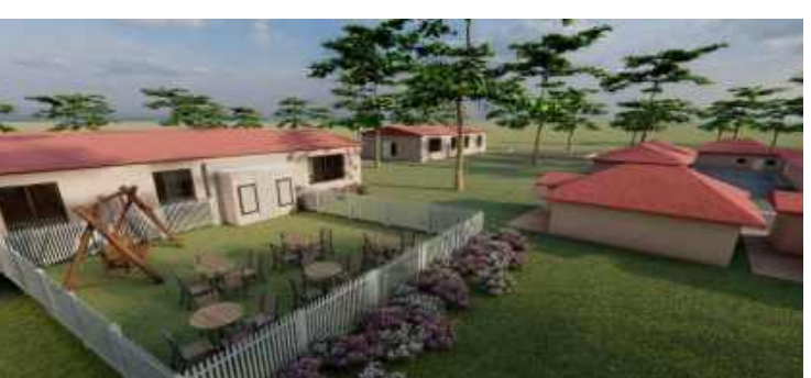
Output 1.4.1: the climate smart village is equipped with efficient waste management facilities, which will be managed by creating job opportunities in waste management for village inhabitants, 50% being youth and 50% being wome