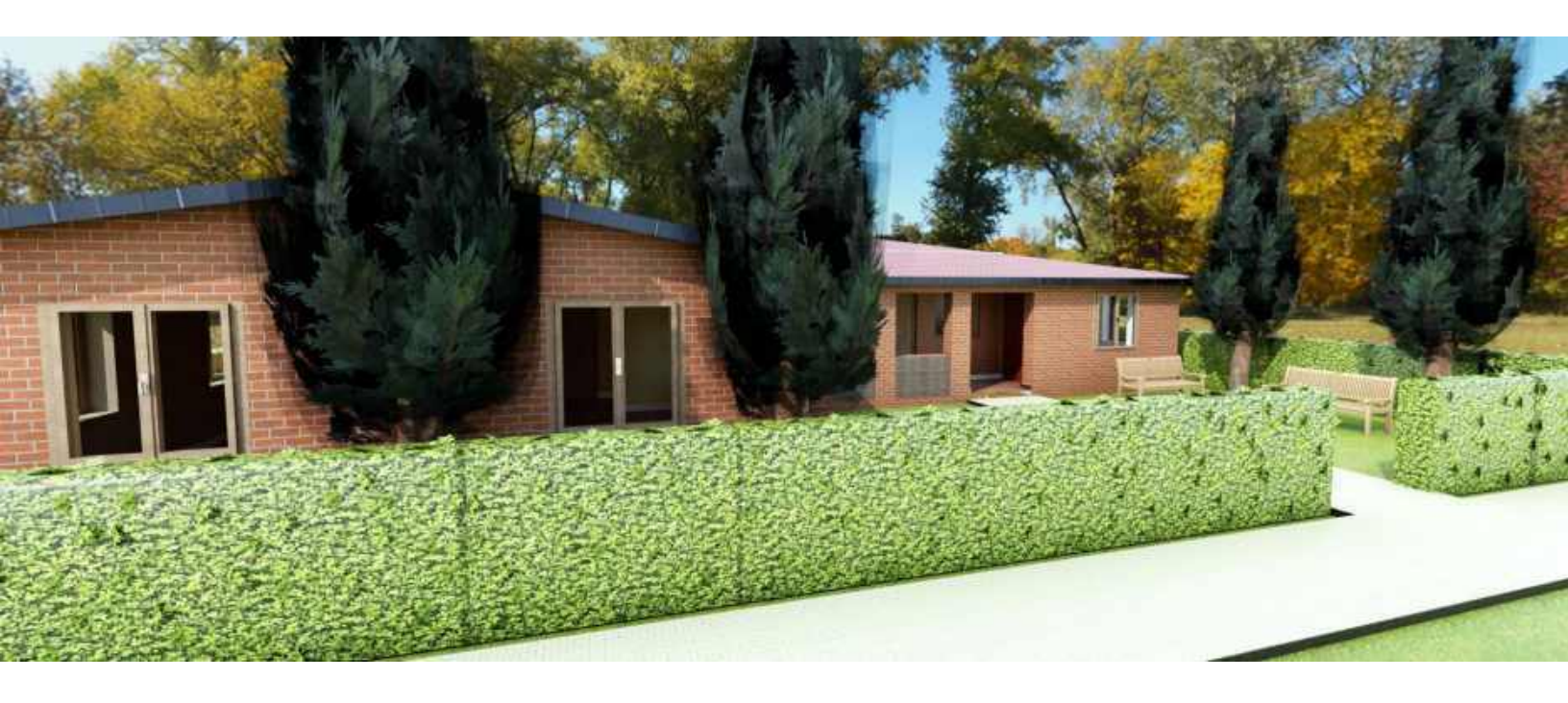
Figure 2: visualization of elements of the ECOVERSE master plan encompassing a well-planned layout featuring resilient buildings, community spaces and socio-economic infrastructure. The village design prioritizes alongside resilience, functionality, sustainability, and community well-being.