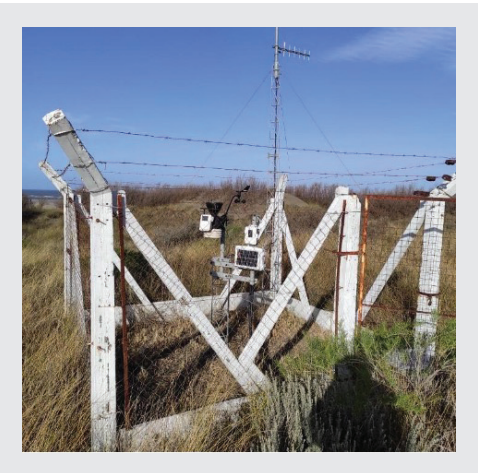
Site 4: Cardenal Cagliero ( Carmen de Patagones), non-working station.

During the site visit to Cardenal Cagliero, it was observed that cattle had caused damage to the fencing. Parts of the fence were reinforced with additional wire from the Ministry of Agrarian Development of the Province of Buenos Aires (MAD); however, the site is not regularly maintained.