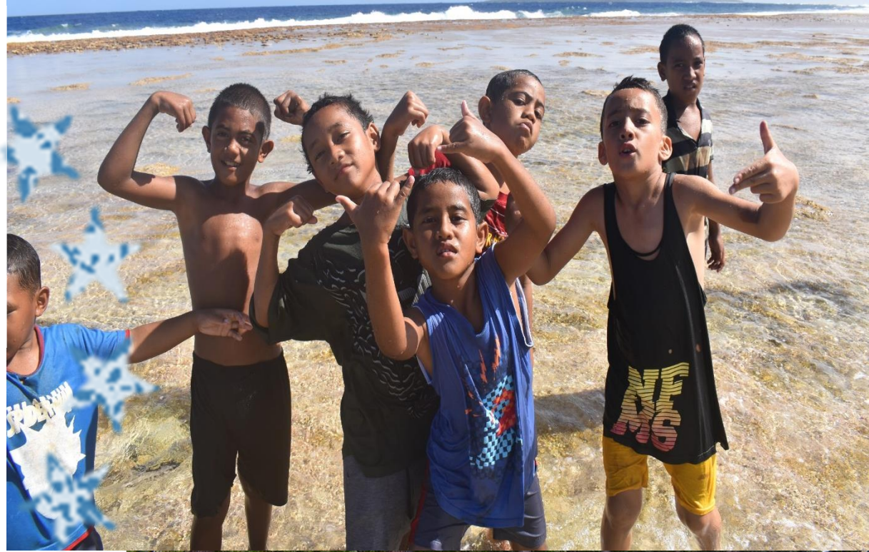
Youth on the Pa Enua Islands of the Cook Islands typical outward migration to the mainland Rarotonga.

Empowering local actors Promoting local ownership and sustainability, Tailored adaptation interventions Specific needs and contexts of local communities