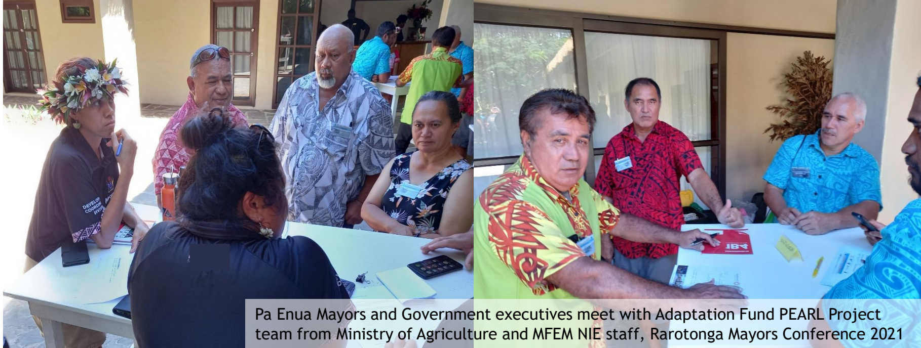
Pa Enua Mayors and Government executives meet with Adaptation Fund PEARL Project team from Ministry of Agriculture and MFEM NIE staff, Rarotonga Mayors Conference 2021