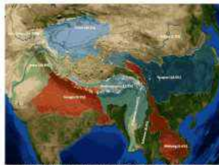
Figure 1. Predicted Percentage of Glacial Melt Contributing to Basin Flows in the Himalayan Basin. (Source: UNEP-GRID, 2012. Monitoring Glacier Change in the Himalayas. LEAS Thematic Focus, September 2012.)

Also, with increasing climate change impacts the region faces many other cryosphere hazards, including Glacier Surges (GSs), Glacial Floods (GFs), Glacial Collapses (GCs), Avalanches, and Ice Dammed Lakes along with the increased frequency of Glacial Lake Outburst Floods (GLOFs). The regional is also prone to glacial floods due to sudden draining of englacial water body, a phenomenon hard to monitor using technologies and predict. The Indus is highly dependent on the meltwater of the Hindu-Kush Himalaya, drawing nearly half its volume from these sources, more so than any other river in the region (see Figure 1).