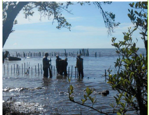
Placing stake lines.

YEARLY TRAINING AND TECHNICAL VISITS TO VULNERABLE COASTAL COMMUNITIES BY PROVINCIAL AND MUNICIPAL TECHNICAL AUTHORITIES TO SUSTAINABLY SUPPORT ECOSYSTEM-BASED ADAPTATION