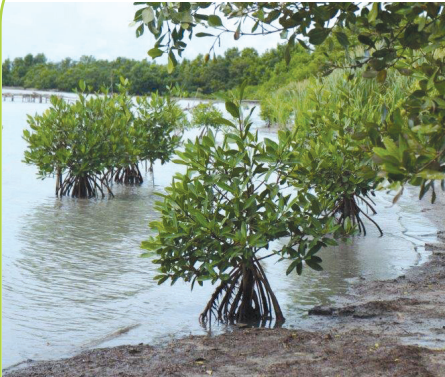
Growing mangroves.

mangroves of between 15 and 18 meters with tremendous health. You can see the level of conservation they have."