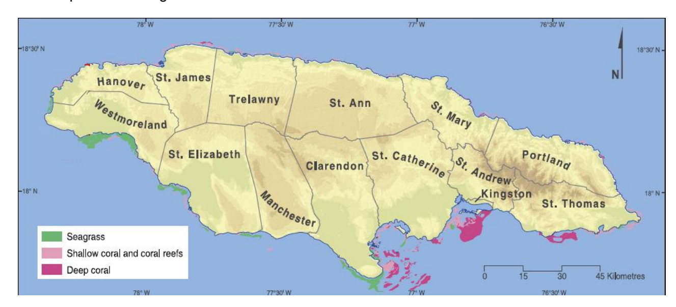
Figure 1 – Map of Jamaica showing 14 parishes

2. The portfolio monitoring mission was included in the secretariat's work plan for FY14 which was approved by the Board at its twentieth meeting (Decision B.20/14). The selected programme, titled "Enhancing the Resilience of the Agricultural Sector and Coastal Areas to Protect Livelihoods and Improve Food Security", was the second direct access programme funded by the Board, and is currently implemented by the Planning Institute of Jamaica (PIOJ) which is the National Implementing Entity (NIE) for Jamaica. A map of the country including the project locations is provided in Figure 1 below.